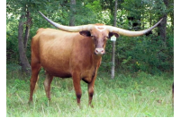
RIO FARLAP SAFARI