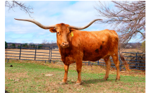
J S OVERDRIVE