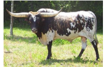
Horseshoe J Charm