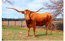
J S OVERDRIVE